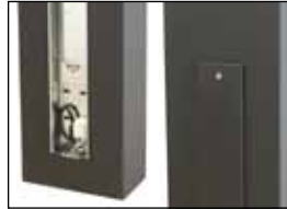
lockable electrical compartment