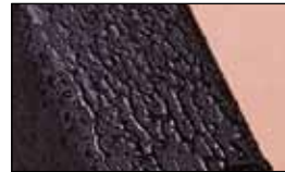
baked on enamel finish for weather resistance