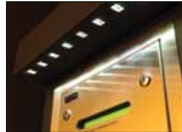
built in ultra-bright LED lighting