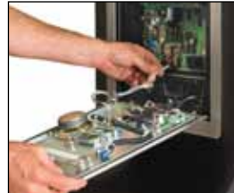
easy access for repair and maintenance